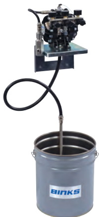
DX70R3-WF Wall mounted pump with paint filter and three air controls ( Pail not included ).