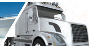
TRUCK AND BUS