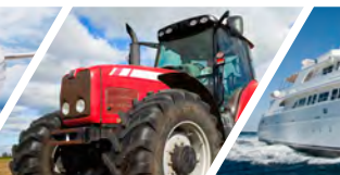
AGRICULTURAL AND OFF ROAD