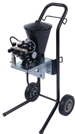
DX70R3-CFG Cart mounted pump with 1.4 gal (6L) gravity bucket feed, filter and three air controls.