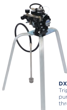
DX70R3-TF Tripod mounted pump outfit with three air controls.