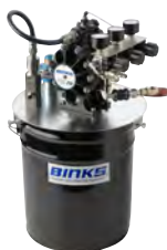
DX70R3-PFA Pail mounted pump with agitator, filter and three air controls ( Pail not included ).